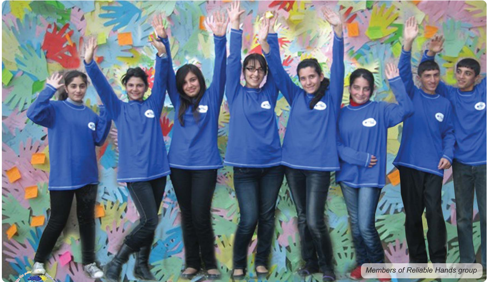
Members of Reliable Hands group