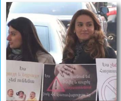
Women protesting in front of the Government building, October, 2010

These are just a few comments out of thousands that men and women, fighting against the reduction of beneficiaries for women during pregnancy period, have placed during the last months on the website of the Civil Society Partnership Network and on other social networks.